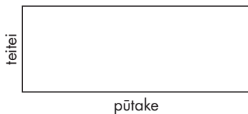
Te teitei me te pūtake o ētahi tapawhā hāngai