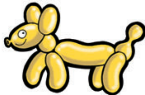
a large dog three balloons

1. Find out what these children pay for their toys.